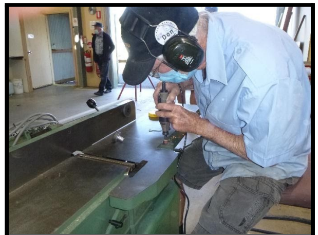
Don doing the finishing touches before commissioning the new planner.