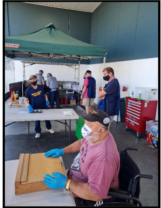
The new crew have turned up ready to go.