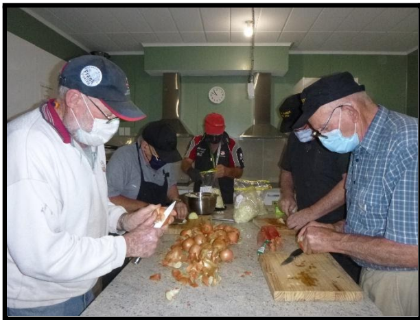
Some of the boys cutting onions for the next Bunnings sausage sizzle.