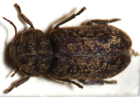
#3. Death Watch Beetle

WOODWORM IDENTIFICATION: 11 TYPES OF WOOD BORING INSECT THAT COULD BE EATING YOU OUT OF HOUSE & HOME – PART 3 OF 12